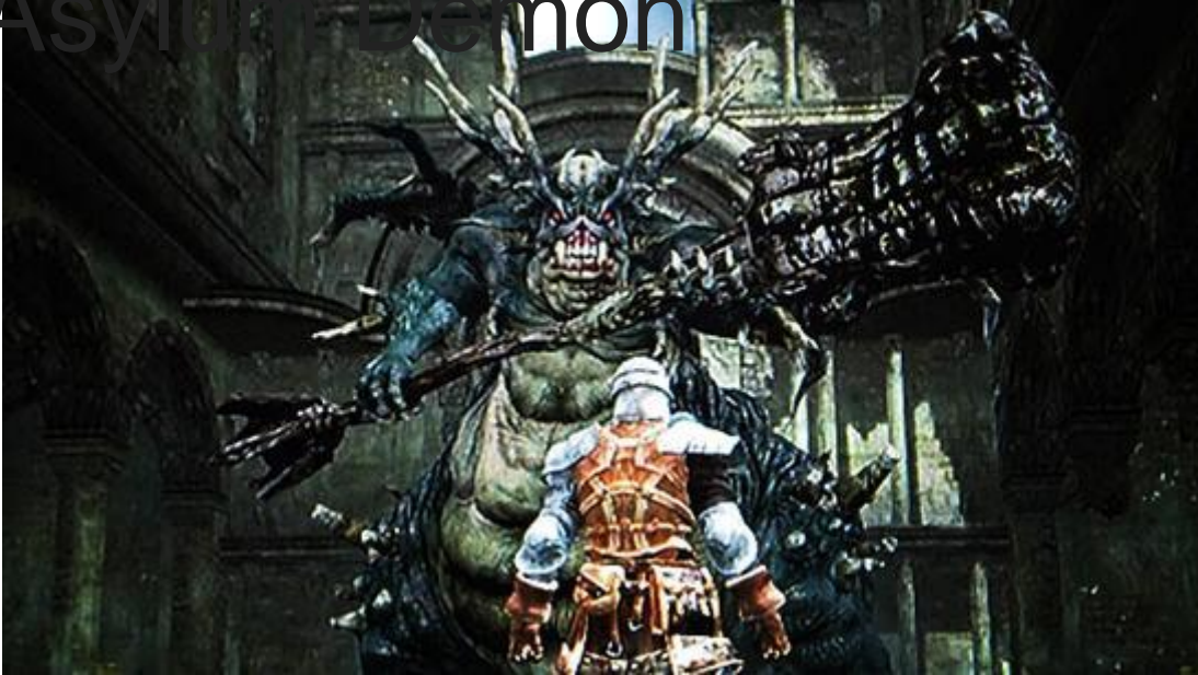
The Asylum Demon

(アサラムデモン) is the first boss encountered in Dark Souls , serving as an introductory challenge that familiarizes players with the game's mechanics and combat system.